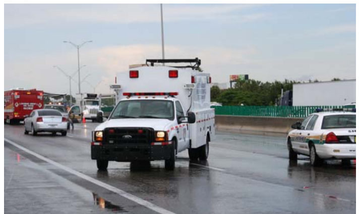
There will be two SIRV patrol zones under the new contract.

The SIRV Team is dispatched by the SMART SunGuide Transportation Management Center (TMC) to major incidents on I-75, I-95, and I-595 in Broward County 24 hours a day, 7 days a week. The SIRV program was designed to assist in the mitigation of delays caused by severe traffic incidents and to increase the safety of emergency responders. They respond to incidents where any lane blockage, fatalities, or structural damage to the highway occur.